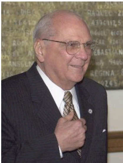
Current President Enrique Bolaños prosecuted his predecessor, Arnoldo Aleman, for corruption.

Bolaños succeeded Aleman in 2001 but soon lost the support of the great majority of PLC militants when he prosecuted Aleman for corruption. Aleman was found guilty of money laundering and sentenced to 20 years in prison. To date, he has mostly served his sentence under house arrest or "district" arrest which allows him some movement in Managua. Aleman is under threat of additional criminal proceeding in Nicaragua, Panama, and the US. Bolaños' efforts to build an alternative electoral option to Aleman's PLC have failed and he has ruled