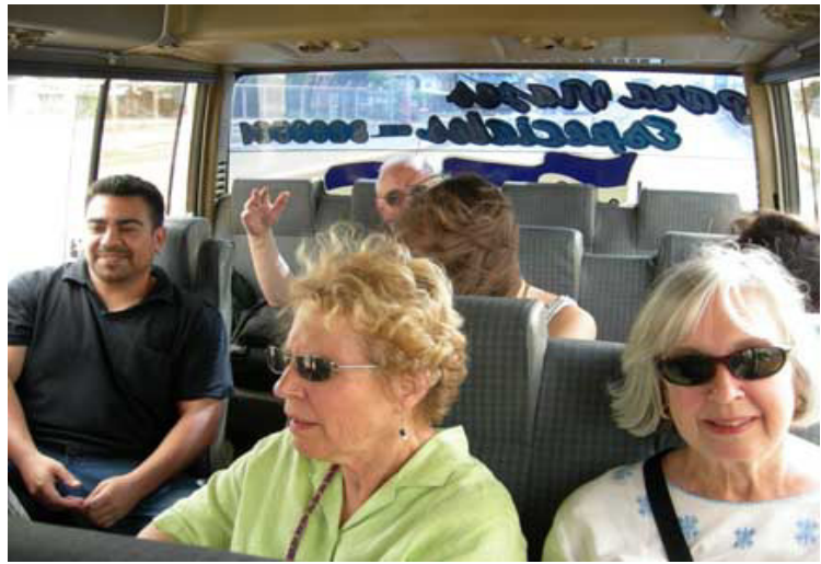
The delegation traveled to Esteli to meet with grassroots leaders.

The delegation met with 8 individuals, office holders, and grassroots organization in Esteli and in Condega, both in the Department of Esteli: