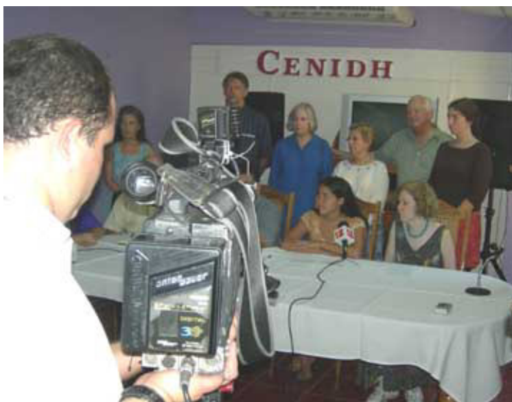
Delegation members face the Nicaraguan media to report on their investigation into the interference of the US in the country's upcoming elections.

On Friday, June 23, the delegation held a press conference co-sponsored by the Ecumenical Committee of English-Speaking Persons Resident in Nicaragua (better known as Casa Ben Linder), Asociación Kairos para la Formación and the Nicaraguan Center for Human Rights in order to present our findings and conclusions. The press conference was attended by journalists from six television stations, the two principal Managua daily newspapers, and 15 radio stations. The press conference received extensive coverage in the Nicaragua media.