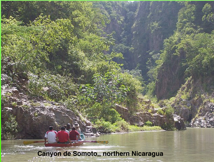
Canyon de Somoto,, northern Nicaragua

A LEARNING AND SERVICE ADVENTURE AUG. 31 - SEPT. 6, 2008