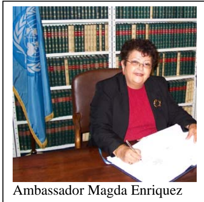
Ambassador Magda Enriquez

http://www.nicanet.org/wp-content/uploads/2009/09/regional-meeting-schedule.pdf .